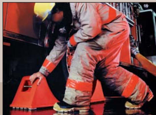
Available in red or yellow with aluminum cleats or rubber pads