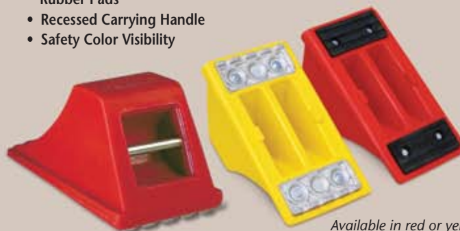
Available in red or yellow with aluminum cleats or rubber pads

Please refer to Wheel Chock User Guidelines on Page 6.