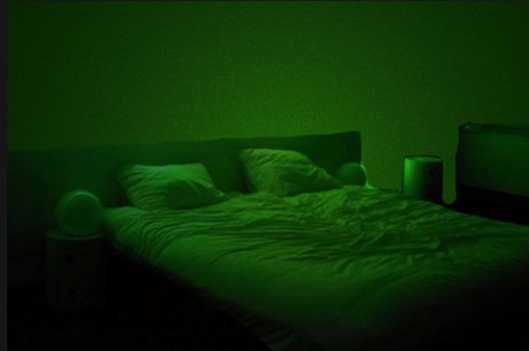
DAY COLOUR WHITE - NIGHT GLOW GREEN