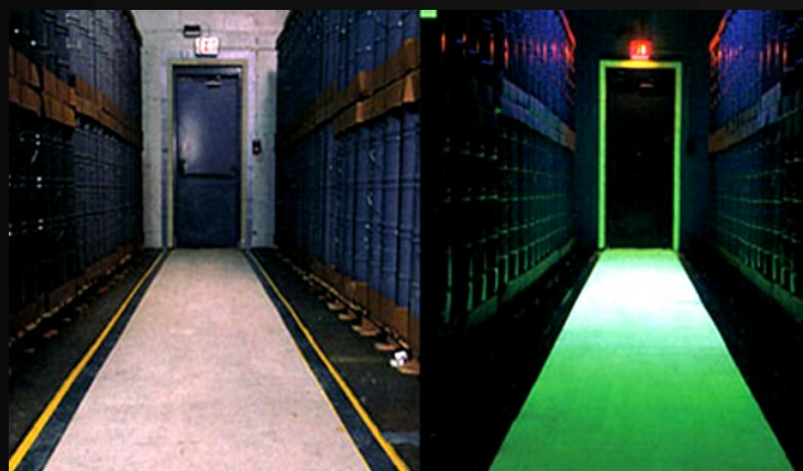
DAY COLOUR WHITE - NIGHT GLOW GREEN