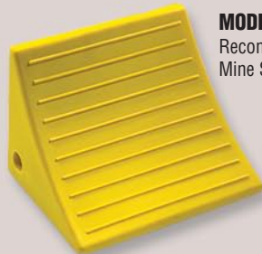
MODEL 1809 Recommended for Mine Support Equipment